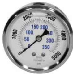
2.50 inch Gage